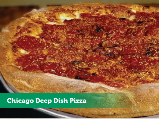
Chicago Deep Dish Pizza