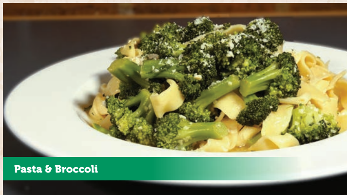
Pasta & Broccoli