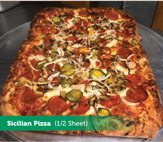
Sicilian Pizza (1/2 Sheet)

New The Garden Party olive oil base, garlic, fresh spinach, banana peppers, red onions, cherry tomatoes, and mozzarella cheese | 15.00