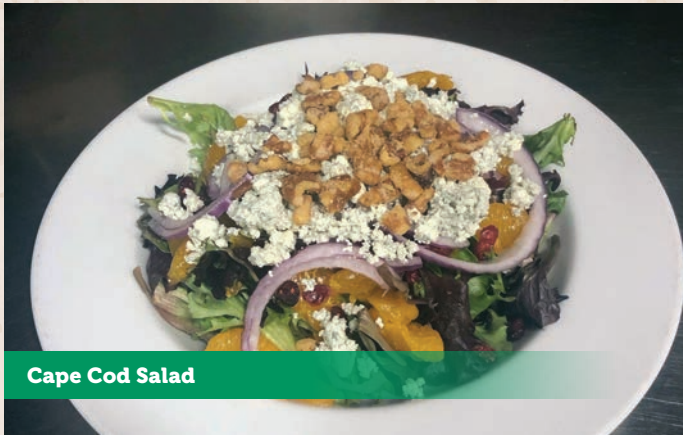
Cape Cod Salad