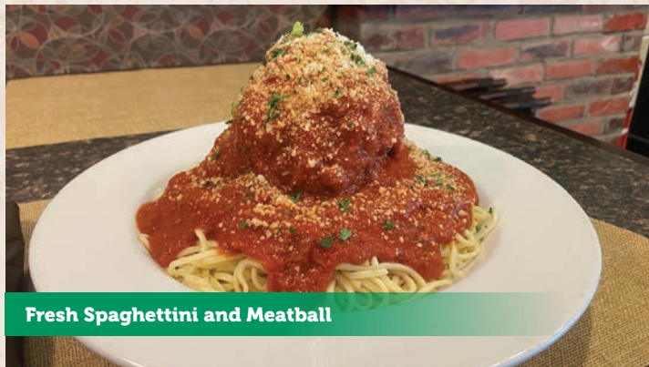
Fresh Spaghettini and Meatball

hand breaded baked eggplant, homemade sauce, mozzarella, fresh spaghettini