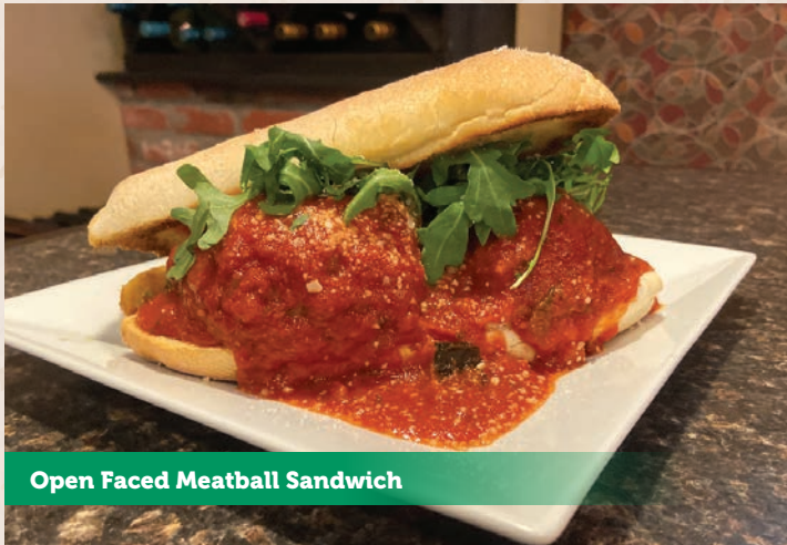
Open Faced Meatball Sandwich

hand breaded baked eggplant, homemade sauce, mozzarella, fresh spaghettini