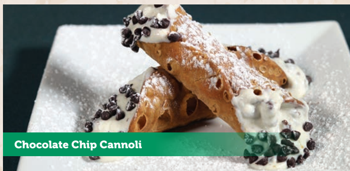
Chocolate Chip Cannoli

bite size pieces of dough covered with powdered or cinnamon sugar