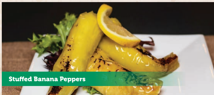
Stuffed Banana Peppers

tender pieces of chicken covered in medium wing sauce, with mozzarella cheese and a hint of garlic sauce served with a side of blue cheese.