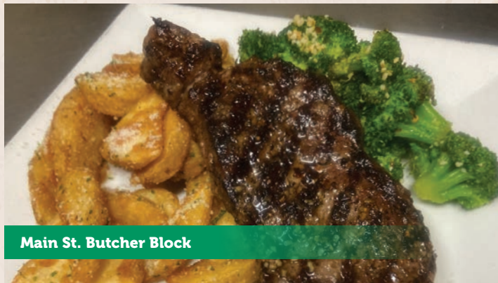
Main St. Butcher Block

garlic parmesan fries, vegetable du jour