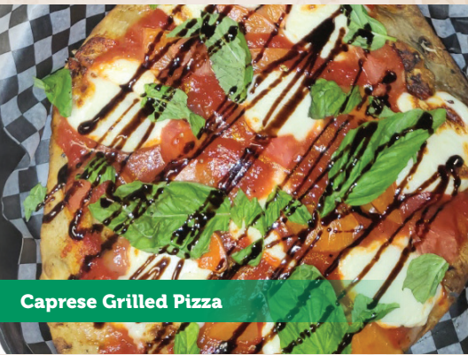
Caprese Grilled Pizza

10 & under includes a kids' drink — 8.00